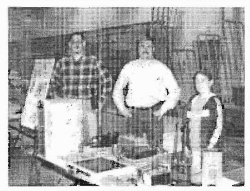
Mt. Beacon Hamfest -04/01