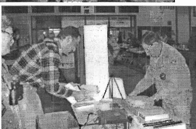
Selling a Commodore 64 for RTTY 04 & 05/01 PCARA Tech Class and the Orange County ARA Hamfest